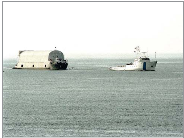
Freedom Star tows a barge with an external tank into Port Canaveral for the first time.

On Sept. 11, 2002, the Freedom Star and its dive team were instrumental in rescuing a lobster diver in distress off Cape Canaveral. The ship was on a certification exercise and near the location of a lobster diving boat that radioed the U.S. Coast Guard for help. One of their divers had experienced difficulty