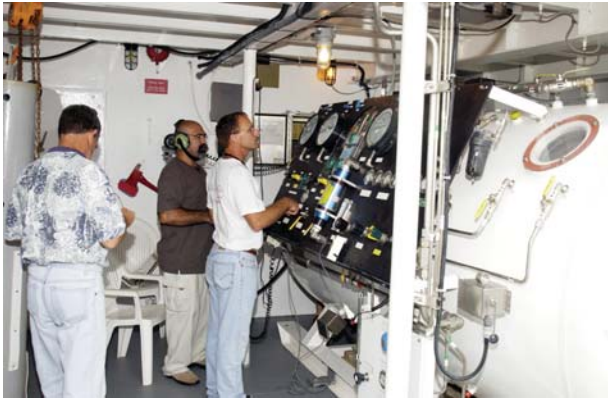
A dive medical technician on the Freedom Star monitors a recompression chamber to help a lobster diver who suffered distress after a dive off Cape Canaveral.

the east coast of Florida. Equipment used for the research included an underwater robot, a seafloor sampler, and the Passive Acoustic Monitoring Sys-