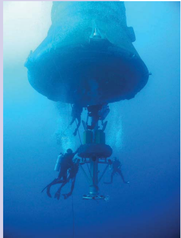
(Above) Divers insert an Enhanced Diver-Operated Plug into the booster nozzle, displacing the water and causing the booster to assume a semi-log or horizontal position.