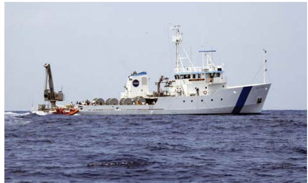
The Liberty Star on the Oculina Banks.

tem (PAMS), originally developed by NASA to monitor the impact of rocket launches on wildlife refuge lagoons at KSC.