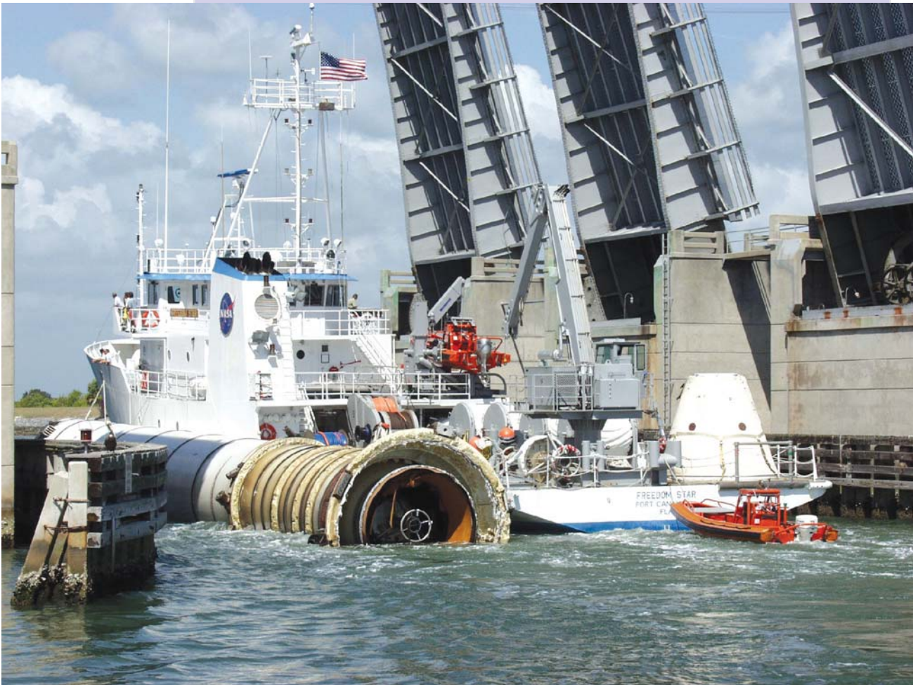
With the booster now alongside in the hip tow position (right), the ship passes through a drawbridge and Canaveral Locks to the Banana River on its way to Hangar AF.