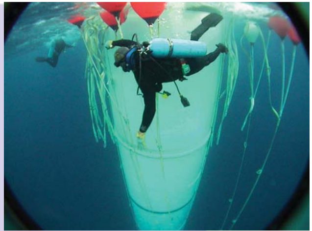
(Top left & right) The ship locates the booster, divers separate the chutes; (left) the ship retrieves the chutes.