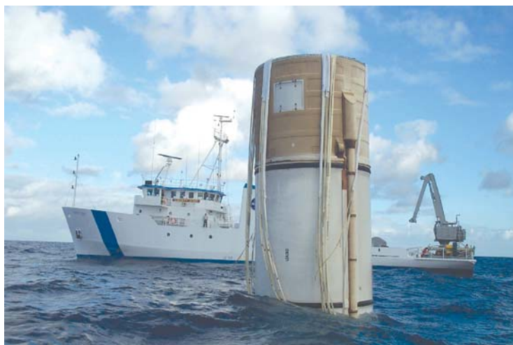
A retrieval ship arrives at a half-submerged solid rocket booster after a Shuttle launch. Divers will prepare the SRB under water to float horizontally and be towed back to Port Canaveral.

The ships also are equipped with two thrusters. The stern thruster is a water jet system that allows the ships to move in any direction without the use of propellers. This system was installed to protect the endangered manatee population that inhabits regions of the Banana River where the ships are based. The system also allows divers to work near the ships at a greatly reduced risk during operations.