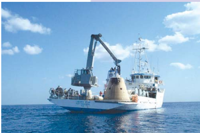
(Above left) The drogue chute is wound onto a reel on deck. (Left) The frustum is lifted from the water by a power block attached to the ship's deck crane.