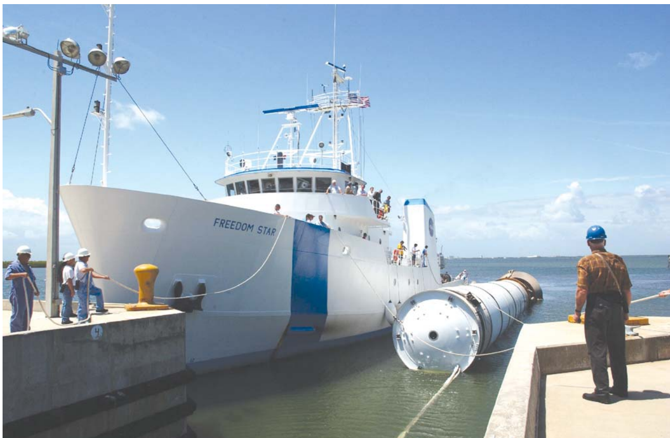
At Hangar AF, the booster is released from the ship. It will be towed to a position where Straddle-Lift cranes can lift it from the water and place it on a rail car for disassembly.

The voyage begins near New Orleans at the Michoud Space Systems Assembly Facility where the external tanks are manufactured. Five days later, the ship and tank arrive at Port Canaveral where a conventional tugboat takes over for the tank's transit upriver to the KSC Launch Complex 39 turn basin.