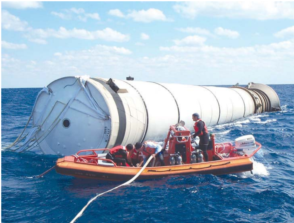
(Left) Divers attach tow lines to the floating booster.